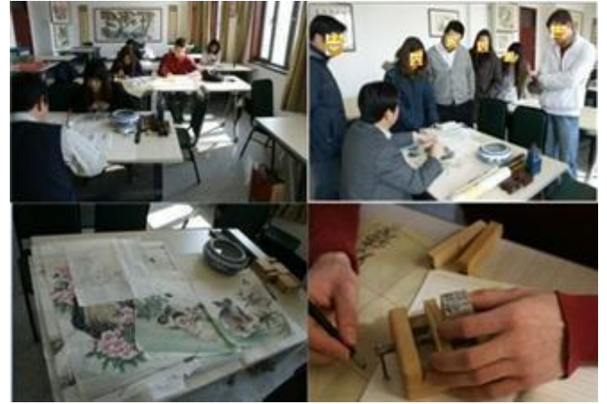
Chinese Traditional Class