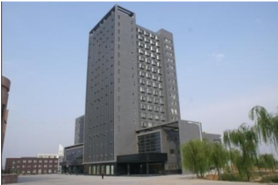
International students Apartment