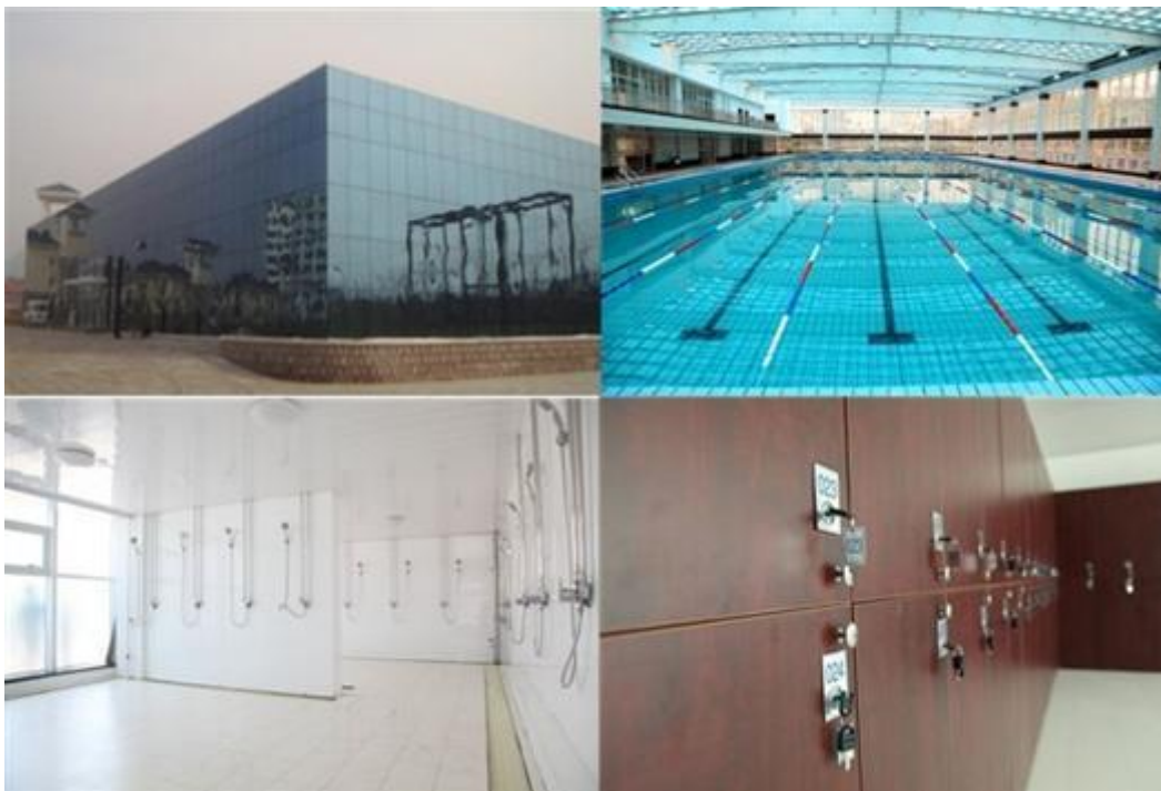
Indoor swimming pool