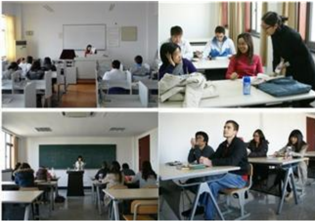
Chinese Language Class